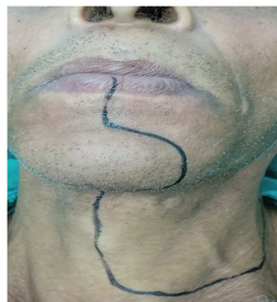
Figure 9. Patient with squamous cell carcinoma of the retromolar space, showing the planning of the surgical approach.

In depth, these lesions tend to invade the masseter and internal pterygoid muscles, producing limitation of mouth opening. In addition, it can cause seizure of bone tissue at the level of the ramus of the mandible or the tuberosity of the upper maxilla, since both maxillary bones converge in this area. Once in the masticatory space, they extend into the pterygomaxillary and infratemporal fossa. [9-13].