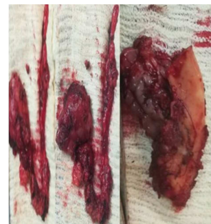
Figure 5. The extracted surgical pieces, lymph node levels and the primary tumor are shown.

Given its location, its early invasion deep into the underlying bone is frequent. When teeth are present, in most cases severe mobility with subsequent fall of the pieces is common.