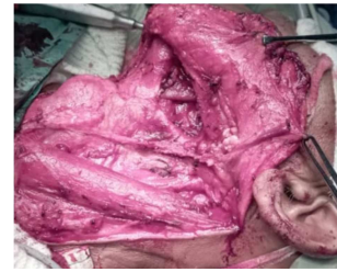
Figure 11. Patient with squamous cell carcinoma of the retromolar space, showing the selective neck dissection already completed. Courtesy of Doctor Otto Alemán Miranda.