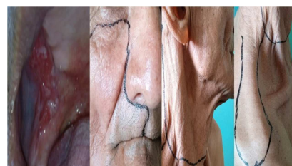
Figure 6. Patient diagnosed with epidermoid carcinoma of the Carrillo mucosa, showing how the intervention was planned.

Retraction can be prevented by performing adequate closures without tension, that is, avoiding, as far as possible, secondary intention closure of surgical defects. Surgical defects can be repaired with the use of flap reconstructions. Inflammatory processes of the gland (sialadenitis) can sometimes be avoided by recanalizing the duct, although it usually recedes spontaneously in the immediate postoperative period or after adjuvant radiotherapy. It is important to indicate oral opening and closing exercises in the immediate and mediate postoperative period, in patients where the surgical manipulation affected the muscles of mastication. [10-12].