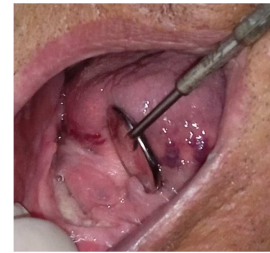
Figure 2. Patient diagnosed with squamous cell carcinoma of the floor of the mouth and inferior residual alveolar ridge.