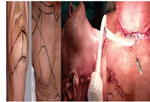
Figure 3. Shows how it was planned and how it turned out at the end of the intervention.