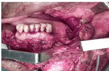
Figure 10. Patient with squamous cell carcinoma of the retromolar space, showing the surgical approach.