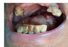
Figure 12. Patient with squamous cell carcinoma of the tongue.